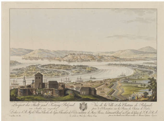
The Danube. A journey into the past. Belgrad

The Danube Cultural Cluster Association was established in Vienna in 2012 as a cooperation platform . It was developed in accordance with the macro-regional initiative of the European Union's Strategy for the Danube Region (EUSDR). Its primary aim is to represent the interests of artists and cultural operators, as well as to establish a communication and cooperation platform for them while generating own projects with an eye toward enhancing the "Danube" as a quality cultural brand. The Danube Cultural Cluster is the only regional (transnational) NGO in the field of culture being an official observing member of the international Steering Group of EUSDR Priority Area 3 (Culture, Tourism & People to People Relations).